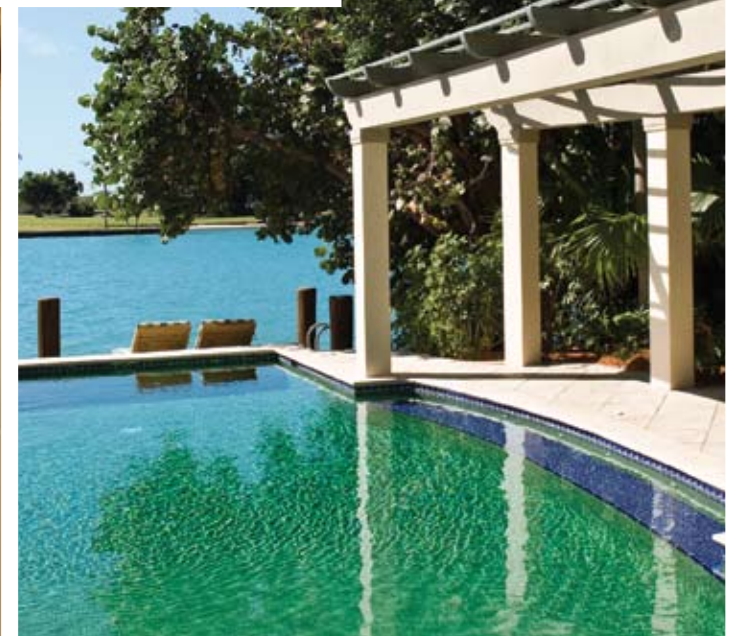
Clockwise from top: Furniture that wasn't "boxy," such as a backless daybed from Room & Board, was chosen for relaxing in the family room; the pool faces