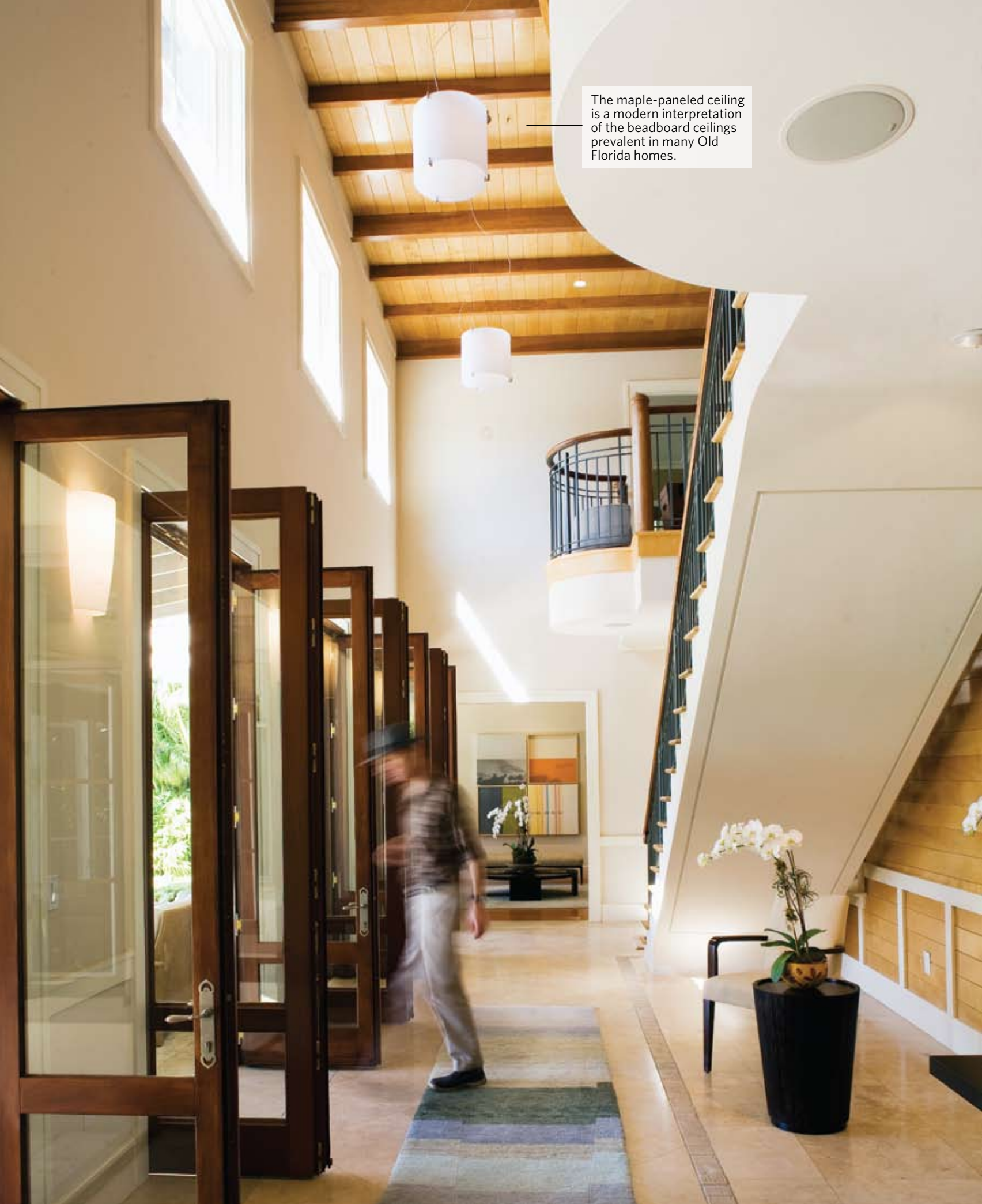
The maple-paneled ceiling is a modern interpretation of the beadboard ceilings prevalent in many Old Florida homes.